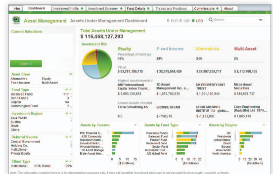
Example: Asset Management App

“The applications have been far wider than we hoped for when we made the business case. Qlikview has reached into almost every area of the business in some way”